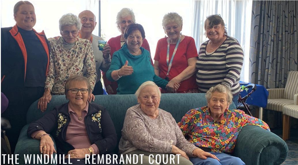
THE WINDMILL - REMBRANDT COURT